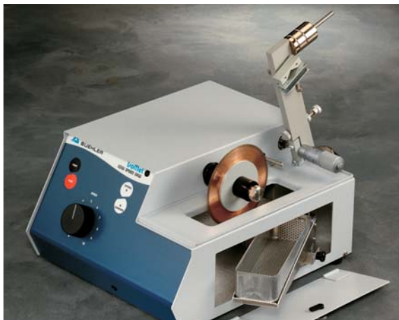
Sectioned samples are easily retrieved through the side coolant tray door and basket.