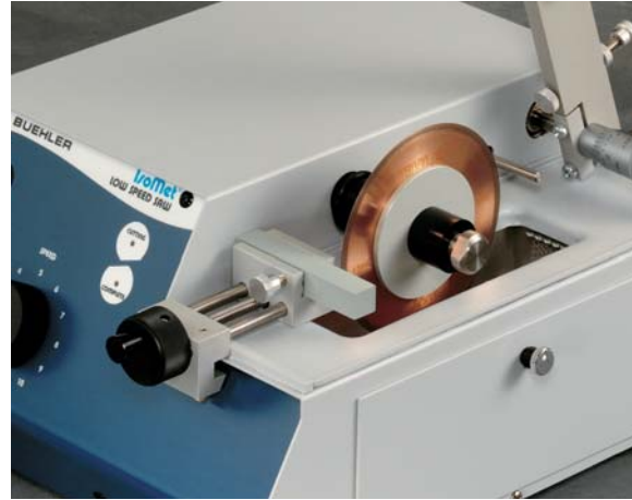
The optional dressing chuck (No. 11-1196) allows dressing of the wafering blade without interrupting the sectioning process.