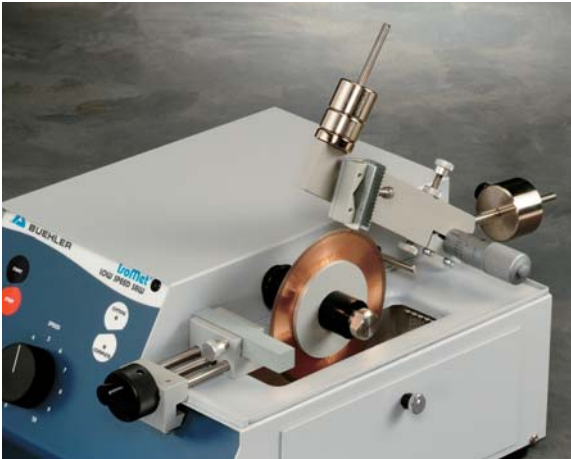
Accurate sectioning is possible with the use of application specific diamond wafering blades and a precision micrometer.