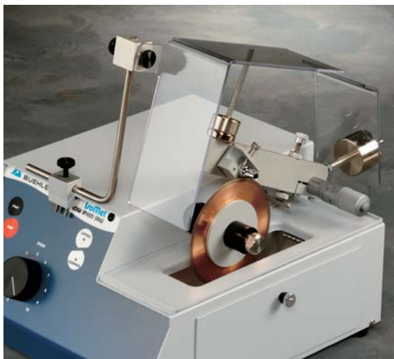
The optional Splash Guard Kit (No. 11-1199) prevents coolant from spraying.